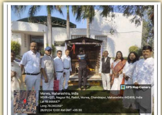
Animal Rescue Operation with Pyar Foundation