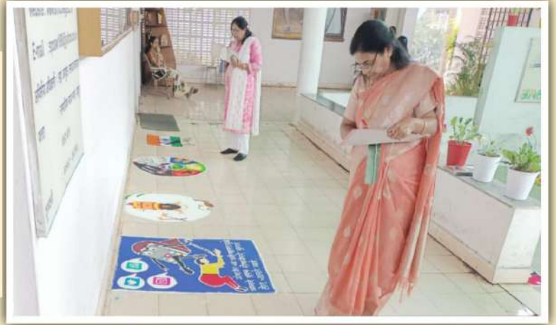
Rangoli Competition organised by college