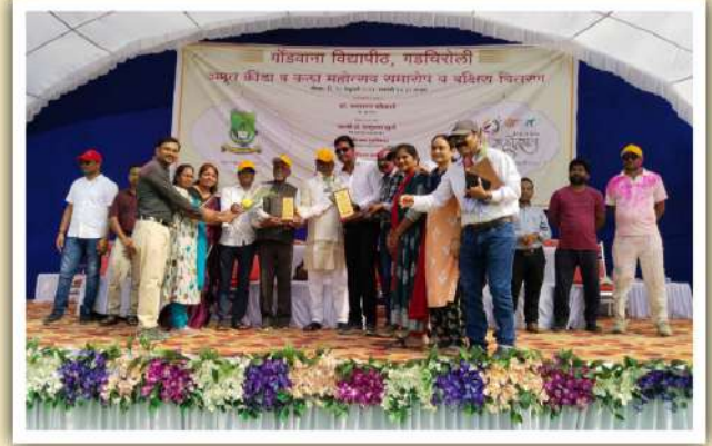
Gondwana University's Cultural Program Competition. Runner Team of Non-Teaching Staff of the College.