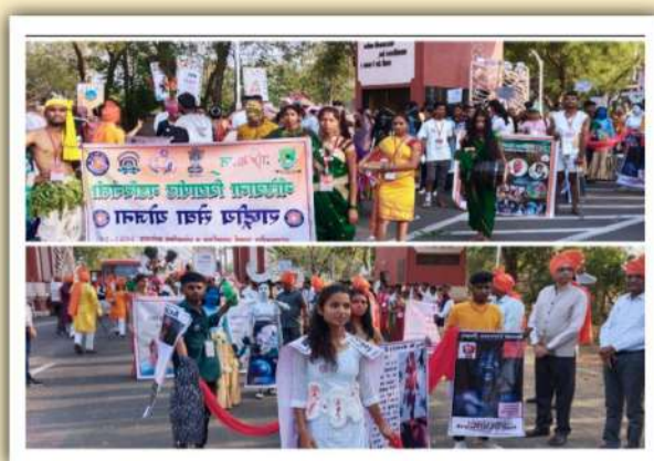
State Level NSS Camp