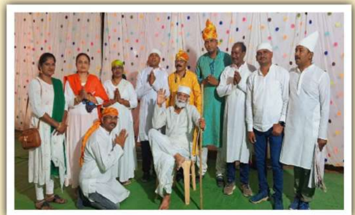
Non Teaching Staff in Gondwana University Cultural Program 2nd Prize Winner