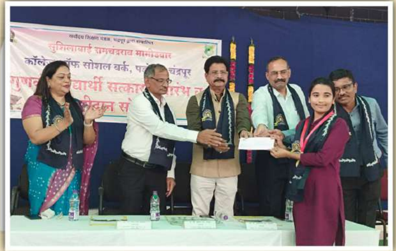
Award To Meritorious students