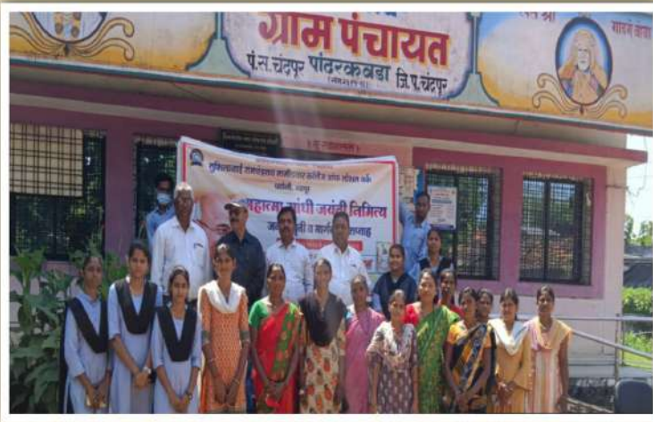
Health Camp at. Pandharkawla