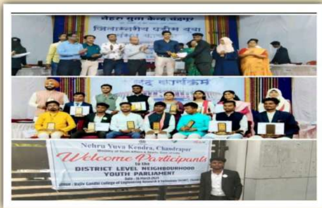
Students participated in Youth Parliament