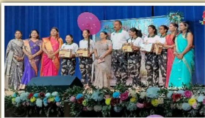
World Woman Day at Ranger College