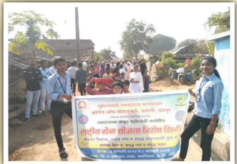
NSS camp at Chaknimbala Village