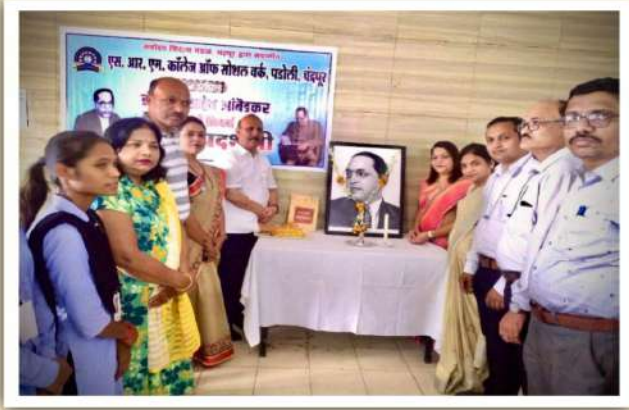
Celebrated Dr. Babasaheb Ambedkar Jayanti Program