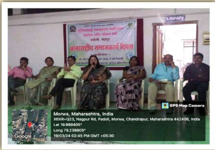
International Social Work Day celebrated in college