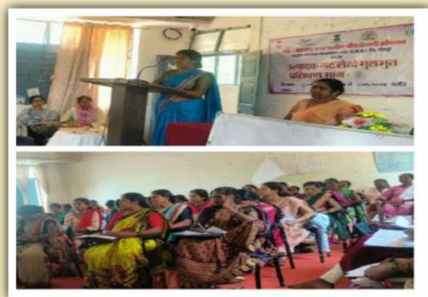
Gramin Jivanjyoti Abhiyan