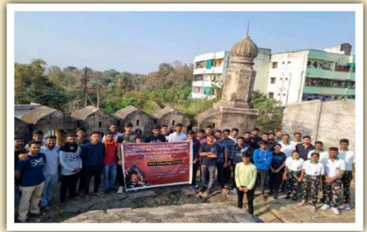
Students participated in "Fort Clean Abhiyan"