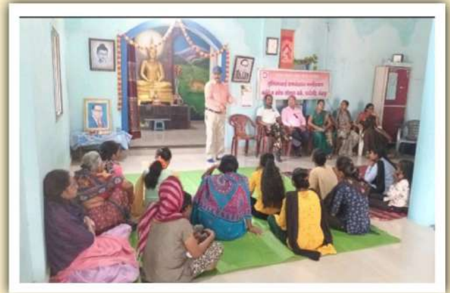
Gramin Jivanjyoti Abhiyan