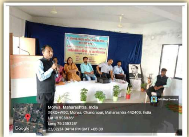
Personality Development Camp at College