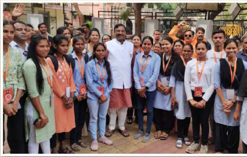
Student with Minister Sudhir Mungantiwar