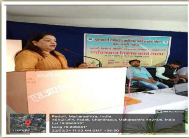
Personality Development Camp at College