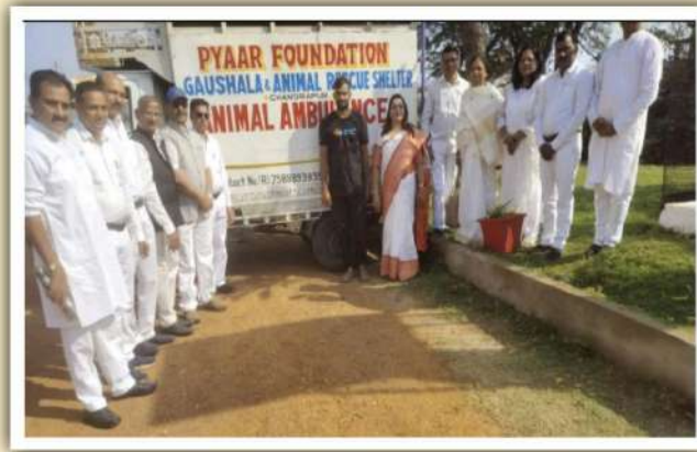
Animal Rescue Operation with Pyar Foundation