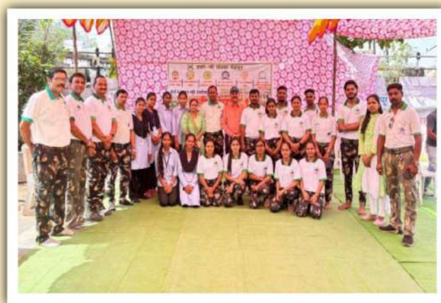
World Water Day in Field Work