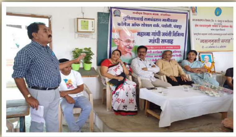
Awareness Program on Vyasnmukti