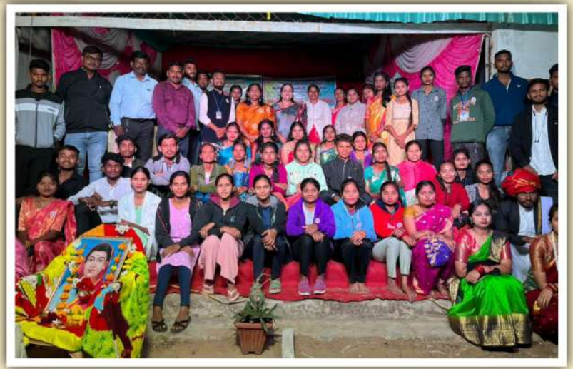
NSS camp at. Chaknimbala Village