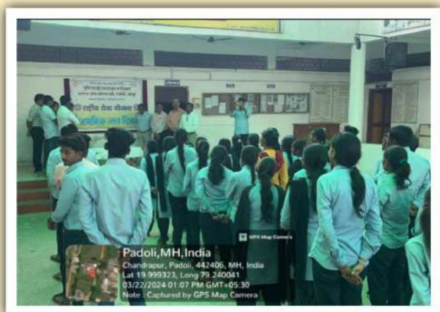
World Water Day in College