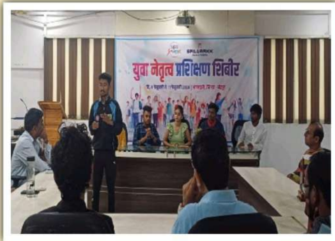
Students Participated in "Youth Leadership Training Camp"